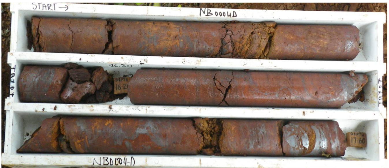
Figure 2: Core Photograph of Core from Nabeba Drill Hole NB0004D