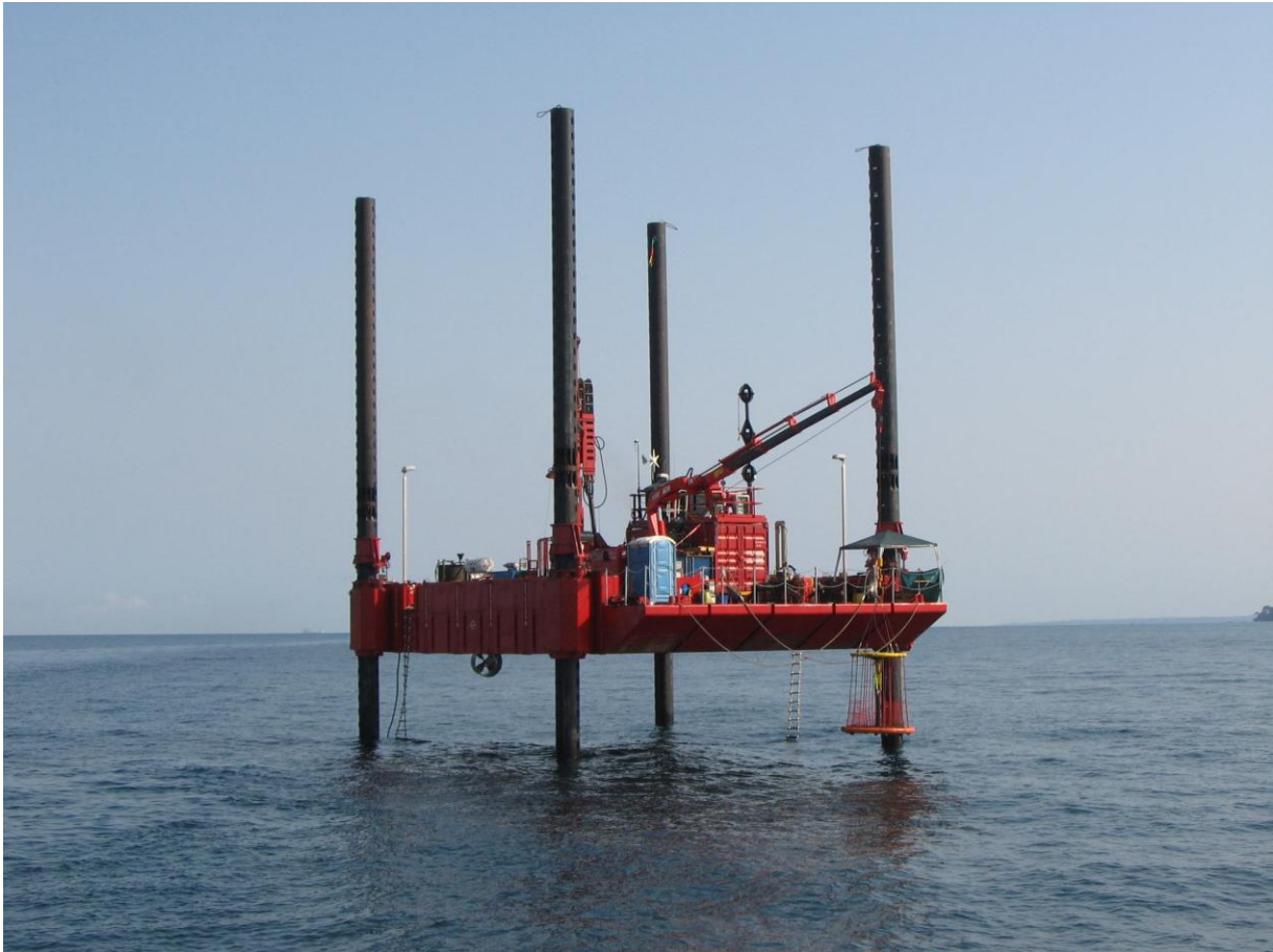
Figure 3: Offshore Drill Rig operating at Lolabe Port